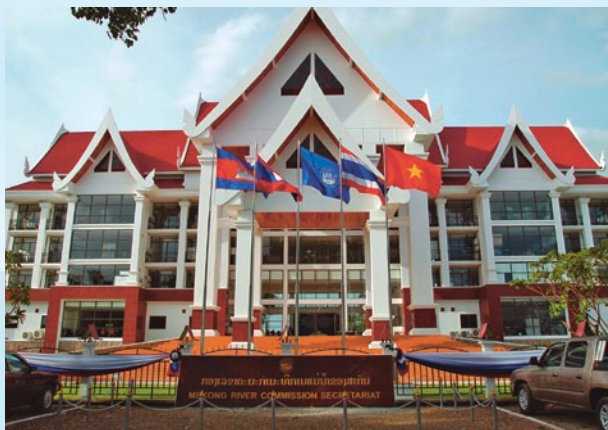
Mekong River Commission Secretariat, Vientiane (Laos)

First and foremost, direct advisory services to the MRC Secretariat are delivered in reference to three MRC programmes: sustainable hydropower, climate change adaptation and flood management. These services include: organisational management advice in the decentralisation of MRC functions to riparian states; the utilisation of internationally recognized, ecological, social assessment tools in the decision-making process for hydropower development that consider poverty and gender issues; networking support that strengthens the MRC in its goal of becoming a knowledge hub for climate change; and in the technical development of flood forecasting systems under climate change conditions. Human Capacity Development measures such as curricula development, training sessions and networking events are employed to integrate the hydropower sustainability agenda within the programmes of various regional academic and training institutions. Furthermore, financial contributions directly help the MRC programmes in executing their work plans.