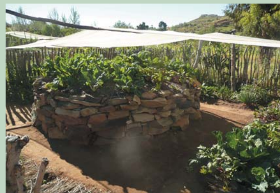
Keyhole garden in Lesotho.