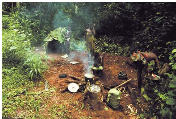
Pygmies preparing a meal in the traditional way: Local knowledge about nutrition should be documented and preserved.