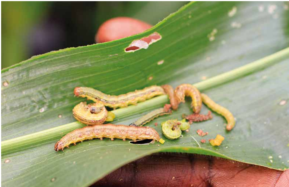
Picture 1 Fall army worm infestation in maize in Ghana.

To be successful, a pest control measure must start at the earliest stage possible. When determining loss/infestation ratios, it must therefore be ensured that they relate to the growth or development stage of the pest population at which a control measure can be successfully taken. It follows that strictly speaking, action thresholds only apply to the conditions under which they were determined.