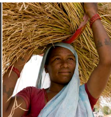
Photo left: Female livestock owner selling hens' eggs and generating income in Ivory Coast. Photo right: Female farmer in Nepal carrying her yield.