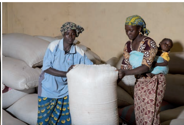
Photo left: Ethiopian woman processing grain. Photo right: Women in Burkina Faso buying cereals.