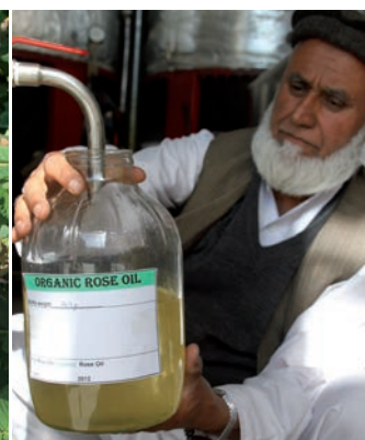
Photo left: Rose picking for organic oil production in Afghanistan. Photo right: Organic rose oil production in Afghanistan.