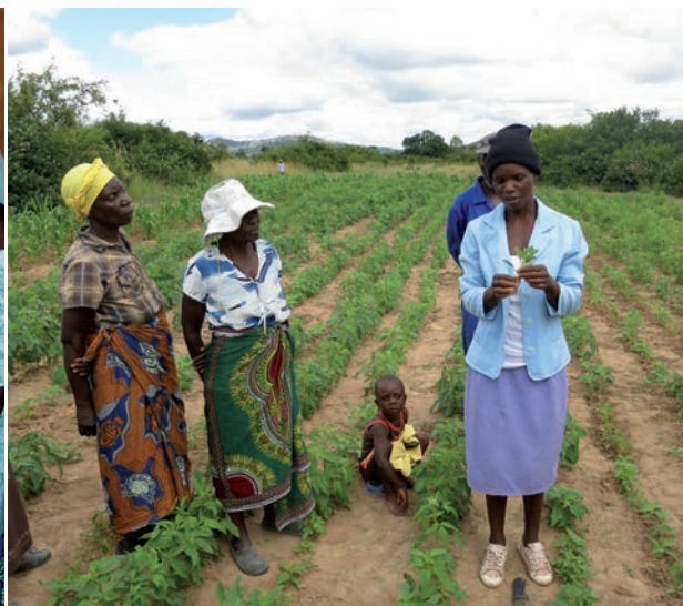
Photo left: A women owned self-organized shop in Niger provides inputs for agricultural production to its members.